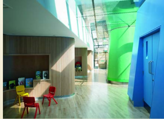
Photos courtesy of Gareth Hoskins Architects and Andrew Lee Photography.

To create a warm, richly colored and safe atmosphere for the Robin House Children's Hospice in Balloch, Scotland, Arch Timber Protection teamed up with customer Bryceland Total Timber Solutions to provide treated Siberian larch wood for the center's interior and exterior construction. The interior wood was pressure treated with Arch's DRICON® fire retardant protection, and the exterior wood received our NON-COM® exterior treatment. Both fire retardant systems allow the wood to keep its rich, natural color while providing an extremely effective surface spread of flame protection.