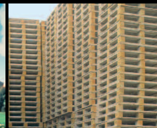
Packaging Timbers to Australia