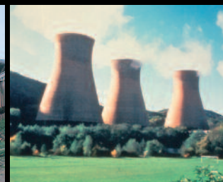
Cooling Tower Timbers